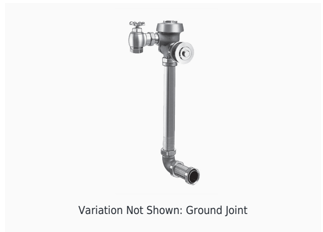
Variation Not Shown: Ground Joint