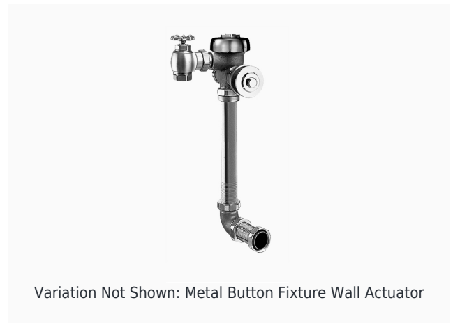
Variation Not Shown: Metal Button Fixture Wall Actuator