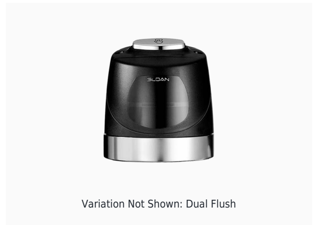
Variation Not Shown: Dual Flush