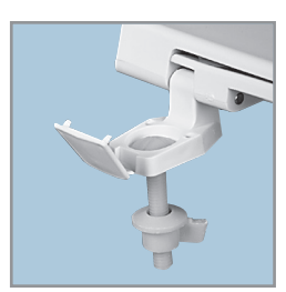
NON-CORROSIVE BOLTS AND WING NUTS