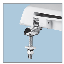
300 SERIES STAINLESS STEEL SELF-SUSTAINING HINGES (1900SS)