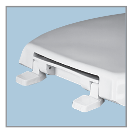
TOP-TITE® HINGES (1900)