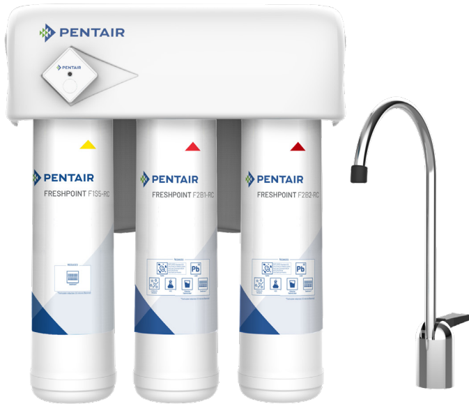
F3000-B2M, (with filter life monitor) shown